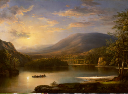
3 1440 Coolidge Hwy Ellen's Isle, Loch Katrine , Robert S. Duncanson