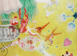
5 10756 W Jefferson Ave Love Flight of a Pink Candy Heart Florine Stettheimer