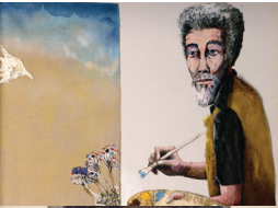
1 River Rouge City Hall 10600 W Jefferson Ave Portrait of a Collagist , Benny Andrews