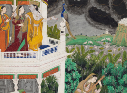
4 11292 W Jefferson Ave Lovers on a Balcony During Monsoon Anonymous-Indian