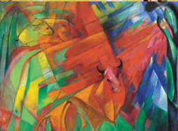
6 10940 W Jefferson Ave Animals in Landscape , Franz Marc