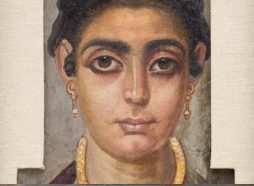
2 10593 W Jefferson Ave Head of a Woman , Unknown Artist, Egyptian