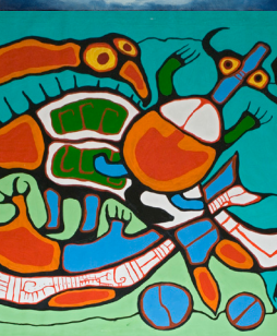
5 Bradner Library 18600 Haggerty Rd Cycles , Norval Morrisseau