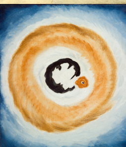
4 Health Sciences Center 18600 Haggerty Rd Dawn II , Arthur Garfield Dove