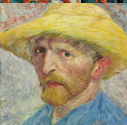
2 Armada Township Park 75400 North Ave Self-Portrait , Vincent van Gogh