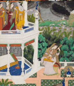
2 McDowell Student Center 18600 Haggerty Rd Lovers on a Balcony During Monsoon Unknown artist, India