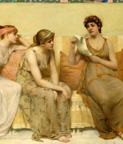
3 Liberal Arts Building 18600 Haggerty Rd Reading the Story of Oenone , Francis Davis Millet