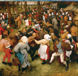
3 Armada Public Library 73930 Church St The Wedding Dance , Pieter Bruegel the Elder