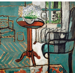
1 Armada Township Hall 23121 E Main St #578 The Window , Henri Matisse