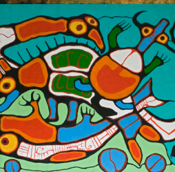
4 Armade in MI 23009 E Main St Cycles , Norval Morrisseau