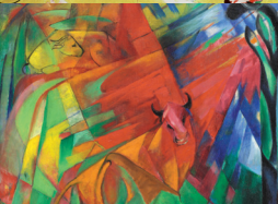
6 10940 W Jefferson Ave Animals in Landscape , Franz Marc