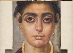
2 10593 W Jefferson Ave Head of a Woman , Unknown Artist, Egyptian