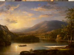
3 1440 Coolidge Hwy Ellen's Isle, Loch Katrine , Robert S. Duncanson