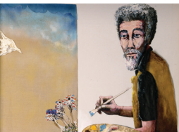
1 River Rouge City Hall 10600 W Jefferson Ave Portrait of a Collagist , Benny Andrews