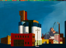
7 66 E Great Lakes St Waterfront