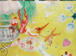
5 10756 W Jefferson Ave Love Flight of a Pink Candy Heart Florine Stettheimer