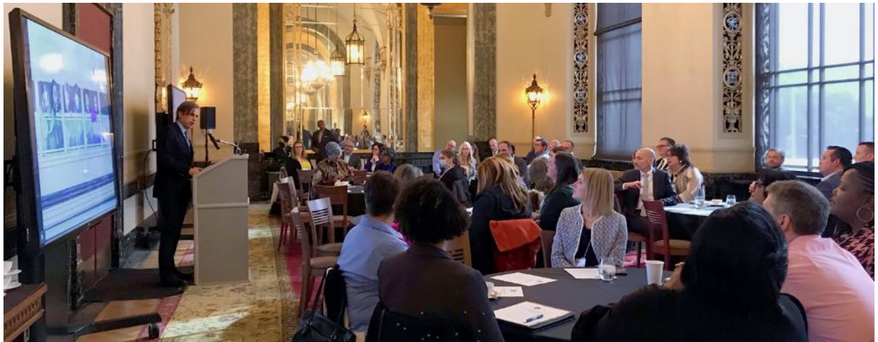
Wayne Regional Educational Service Agency (WRESA) gathering in Crystal Gallery

In March, the DIA hosted the Wayne Regional Educational Service Agency (WRESA) and principals representing the county's school districts. Guests were provided presentations by DIA Education and Community Affairs departments which focused on educational resources and opportunities for students and teachers to engage with the arts at DIA, both onsite and in the classroom. They also experienced tours led by our gallery teachers and interpretation programs volunteers.