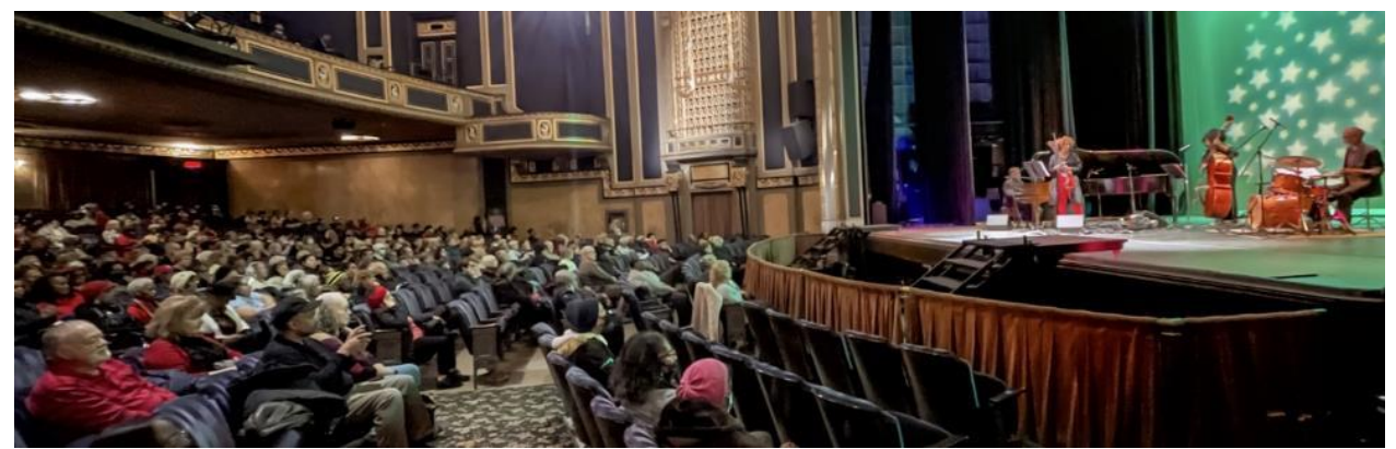
Marion Hayden Quartet performing in The Detroit Film Theatre in December

In September of 2023, the DIA launched a monthly program featuring live musical performances curated for adults 55 and over. Groups are provided with free transportation, complimentary refreshments, and discounts in the museum gift shop. The December concert had such high demand that an encore performance was added.