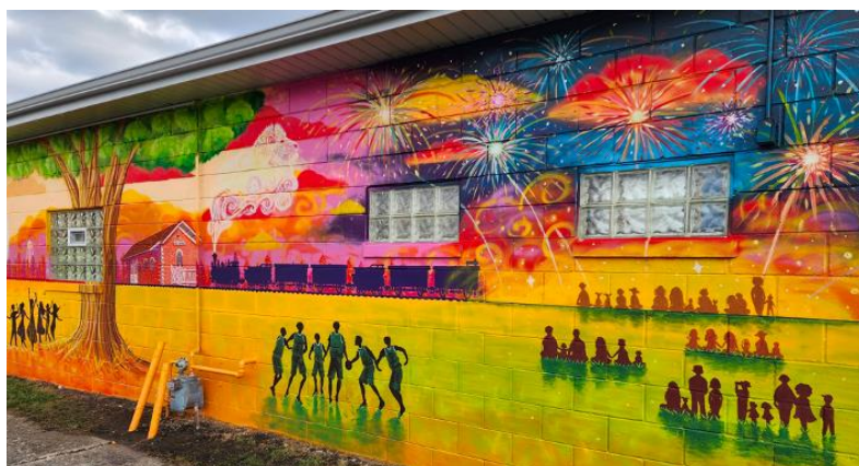
Lenox Township mural at the New Haven Village Community Center