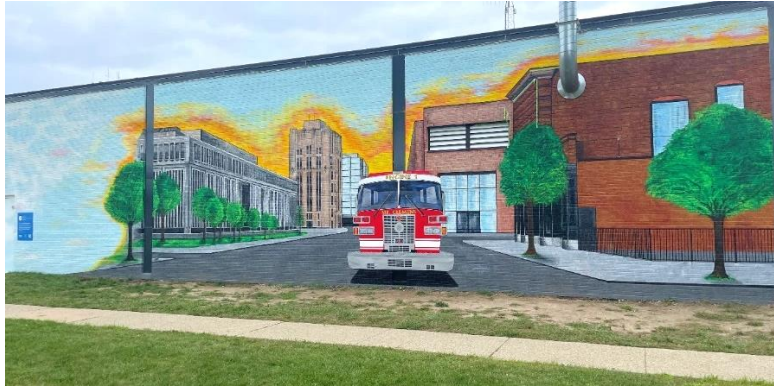
Completed mural at the Mt. Clemens Fire Department

The DIA partnered with the Cities of Mt. Clemens and St. Clair Shores in 2022. Painting of both projects began in April 2023. St Clair Shores was completed in June, while Mt. Clemens was completed in September. A third mural was completed in Lenox Township on the New Haven Village Community Center. A dedication ceremony was held on November 1st, 2023.