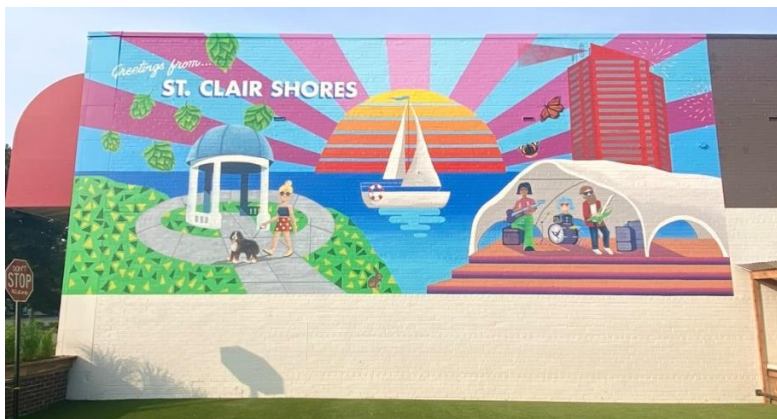
Mural at Great Lakes Ace on Greater Mack Ave in St. Clair Shores