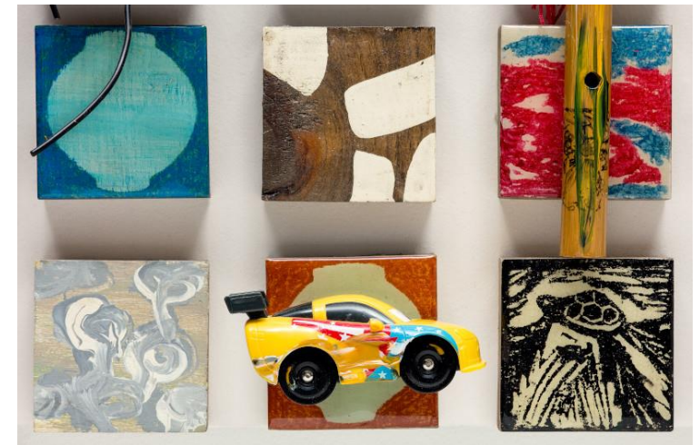
Happy World – Scattered Crumbs, detail

Ik-Joong Kang, Happy World - Scattered Crumbs , 2011 - 2014, mixed media on wood. Detroit Institute of Arts, Museum Purchase, Friends of Modern Art Acquisition Fund, 2015.66.