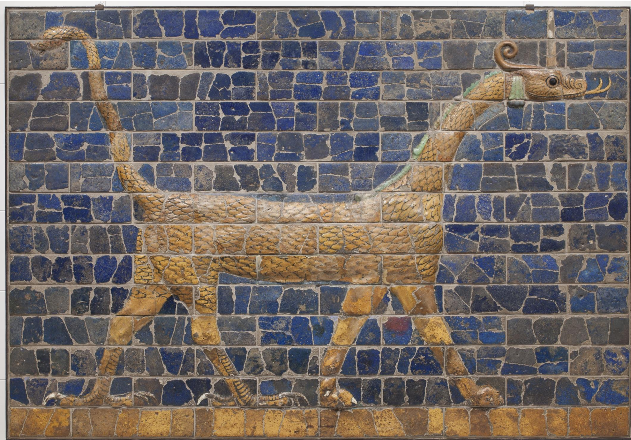
Babylonian, Mesopotamian; Neo-Babylonian, Mesopotamian, Mushhushshu-dragon, Symbol of the God Marduk, 604 - 562 BCE, molded and glazed baked brick. Detroit Institute of Arts, Founders Society Purchase, General Membership Fund, 31.25.