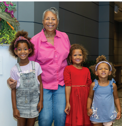
Members of all ages enjoy Iron Giant at a Member Movie Night screening in the DIA's Detroit Film Theatre.

DIA Volunteers are integral to connecting visitors with the art. The DIA requires all volunteers to be museum members. This year, volunteers contributed more than 40,000 hours to the museum – the equivalent of $1,286,741.70!