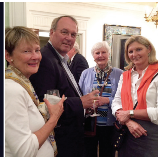
Members of the Associates of the American Wing at a reception in a private collector's New York City apartment after a tour of The Whitney.