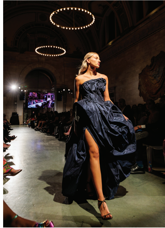
Neiman Marcus model in couture gown.