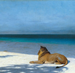
3 10363 Outer Dr. W. Solitude , Jean-Leon Gerome