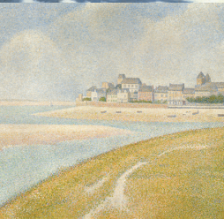
4 14310 Rosemont Ave. View of Le Crotoy from Upstream , Georges Seurat