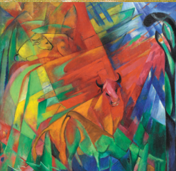
5 17425 W. Grand River Ave. Animals in a Landscape , Franz Marc