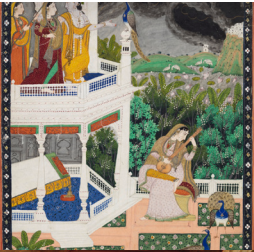
1 19800 Grand River Ave. Lovers on a Balcony During Monsoon Anonymous-Indian