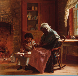
2 19655 Grand River Ave. Sunday Morning , Thomas Waterman Wood