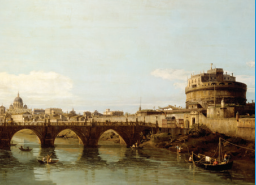
3 Hidden River Plaza 11 N Saginaw St View of the Tiber in Rome with the Castel Sant'Angelo , Bernardo Bellotto