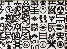
4 The Crofoot 1 S Saginaw St Movement #27 , Kwesi Owusu-Ankomah