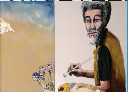
5 The Dobrusin Law Firm 29 W Lawrence St #210 Portrait of a Collagist , Benny Andrews