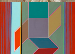
7 Gallery 46 46 N Saginaw St Untitled , Alvin Loving