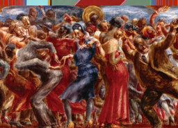
8 City Hall 47450 Woodward Ave Savoy Ballroom , Reginald Marsh