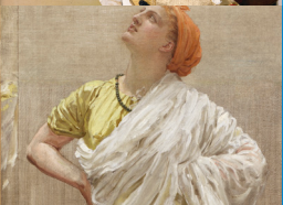
6 K&R Studios 35 N Saginaw St Study for Birds , Albert Moore