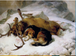
1 Oakland County Sheriff's Office 110 E Pike St Chevy , Edwin Henry Landseer