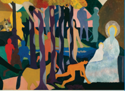
2 100 N Saginaw St Blue Madonna , Bob Thompson