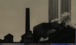
9 Dearborn Historical Museum Commandant's Quarters Ford Rouge Plant (from Dix Rd. Bridge)