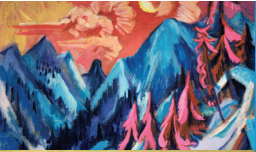
1 Ford Community and Performing Arts Center Winter Landscape in Moonlight Ernst Ludwig Kirchner