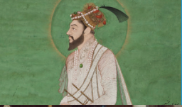
7 Wagner Place Portrait of a Mughal Prince, possibly a copy of a portrait of Sultan Shuja (1616-1659) Unknown, Islamic