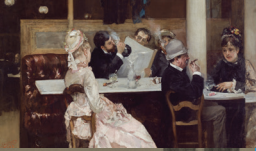
8 Wagner Place Café Scene in Paris , Henri Gervex