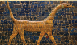
3 Habib's Cuisine Mushhushshu-dragon, Symbol of the God Marduk Unknown Artist