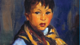
10 Bryant Branch Library Boy with Plaid Scarf , Robert Cozad Henri