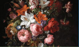
6 Real Estate One / Great Commoner Flowers in a Glass Vase , Rachel Ruysch