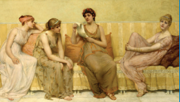
2 Ace Diamond Jewelers Reading the Story of Oenone , Francis Davis Millet