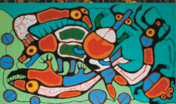
4 Blick Art Materials Cycles , Norval Morrisseau