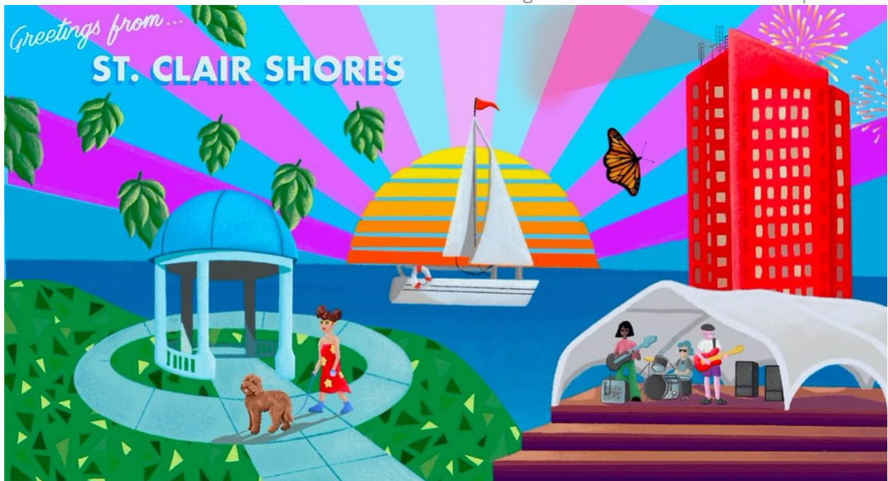
Design for Great Lakes Ace on Greater Mack Ave in St. Clair Shores