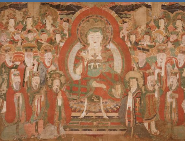
Figure 3: Korean, Ksitigarbha as Supreme Lord of the Underworld, early 18th century, opaque watercolor and ink on silk, 86 x 118 in., DIA 24.106, City of Detroit Purchase.

made with the pigment smalt. Smalt is it is prepared from finely crushed cobalt blue glass; these glass fragments are visible in the bottom image of figure 2. In the 16th century, smalt was likely prepared from cobalt ores mined in Iran. Based on research by MCH, by the seventeenth century, India likely started importing this pigment from Holland through the Dutch East India Company. By analyzing more paintings and comparing smalt compositions, we will get a fuller picture of trade materials throughout Asia.