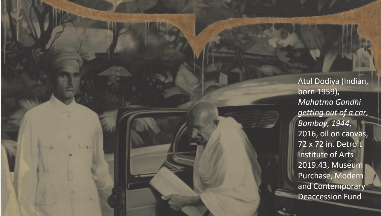
Atul Dodiya (Indian, born 1959), Mahatma Gandhi getting out of a car, Bombay, 1944 , 2016, oil on canvas, 72 x 72 in. Detroit Institute of Arts 2019.43, Museum Purchase, Modern and Contemporary Deaccession Fund