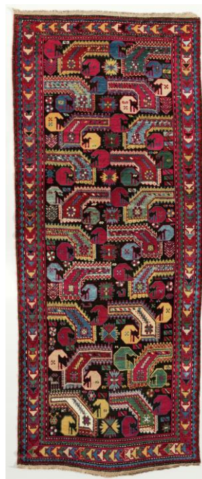
Azerbaijani, Goradiz Carpet, ca. 1890, wool and silk, 120 1/4 x 49 in. Detroit Institute of Arts no. 2017.71, Gift of V. Howard

May: Asian Pacific American Heritage Month — Online programming throughout the month. More details to follow!