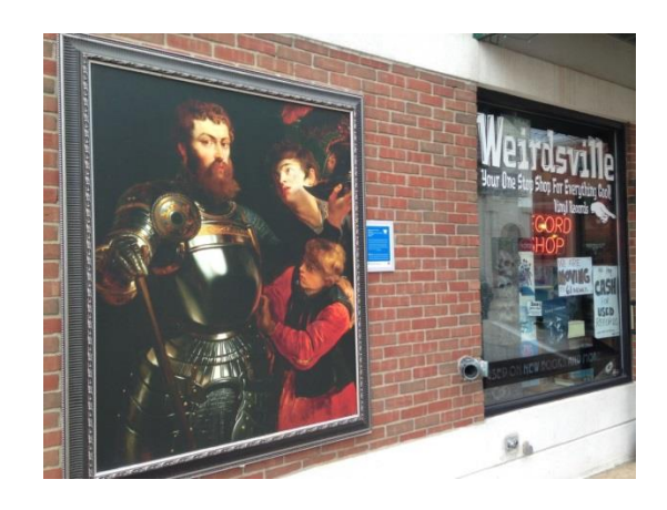
Inside/Out 2014: Warrior with Two Pages by Peter Paul Rubens installed in Mt. Clemens