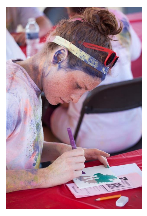
Splash Event Art Making Workshop, St. Clair Shores, MI – September 2014

of the nine Inside | Out reproductions in St. Clair Shores, take free Zumba and yoga classes, and receive information from Beaumont doctors on the health benefits of participation in the performing and fine arts. In addition, DIA studio staff led an art-making project allowing attendees to get first-hand experience on the connection between art and wellness.