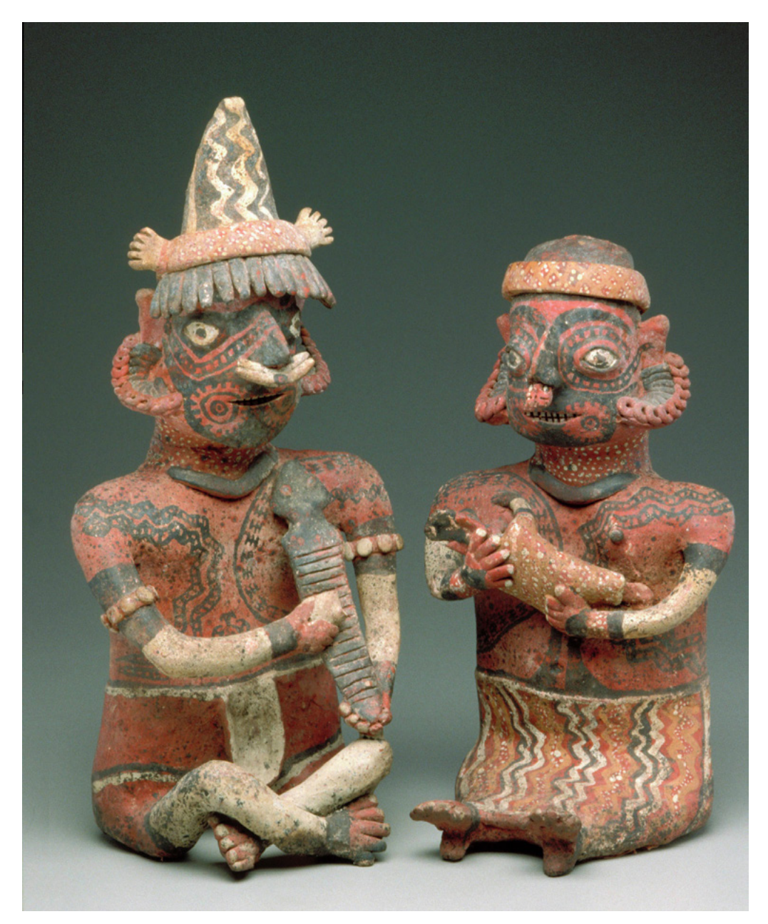
Male Figure, between 100 BCE and 400 CE, polychromed clay. Unknown artist, Nayarit, Precolumbian. Detroit Institute of Arts