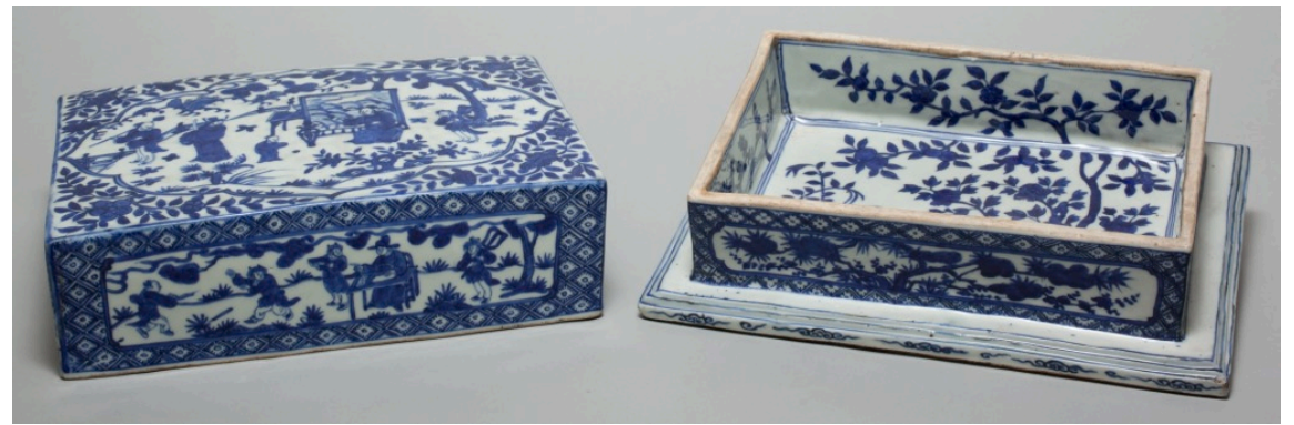
Chinese. Blue and White Porcelain Box , 13th century. Porcelain with underglaze cobalt and glaze, Overall: 4 3/8 × 12 1/4 × 8 5/8 inches. Detroit Institute of Arts, Gift of K. T. Keller. 47.368