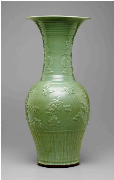
Chinese. Temple Vase , 1279–1368. Porcelaneous stoneware, celadon glaze, 28 1/8 × 12 3/4 inches. Detroit Institute of Arts, Gift of Mrs. Edsel Ford. 28.1