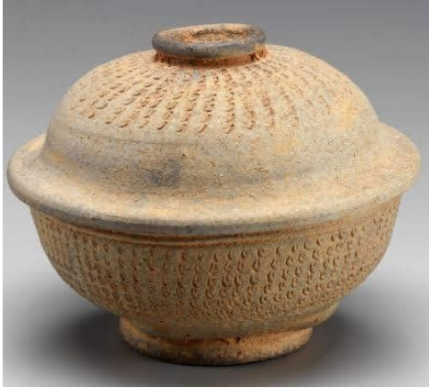
Korean. Cinerary Urn , 7th–8th century. Stoneware, 4 1/2 × 5 5/8 inches. Detroit Institute of Arts, Gift of Klaus F. Naumann. 1986.35