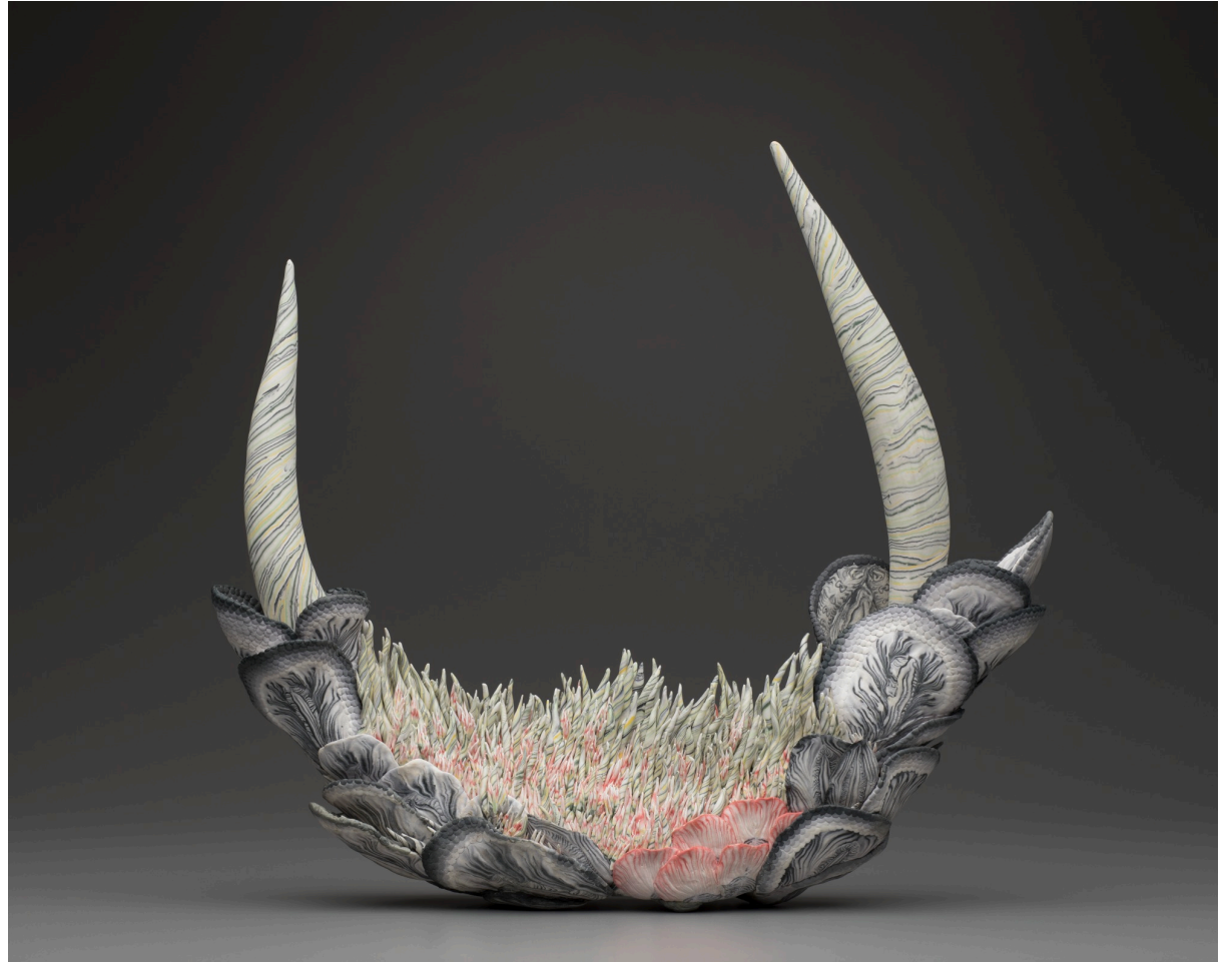
Tomoko Konno (Japanese, born 1967). Creature , 2015. Porcelain, pigments, clear glaze, 21 3/4 × 23 1/8 × 5 3/4 inches. Detroit Institute of Arts, Museum Purchase, Joseph H. Parsons Fund. 2017.8