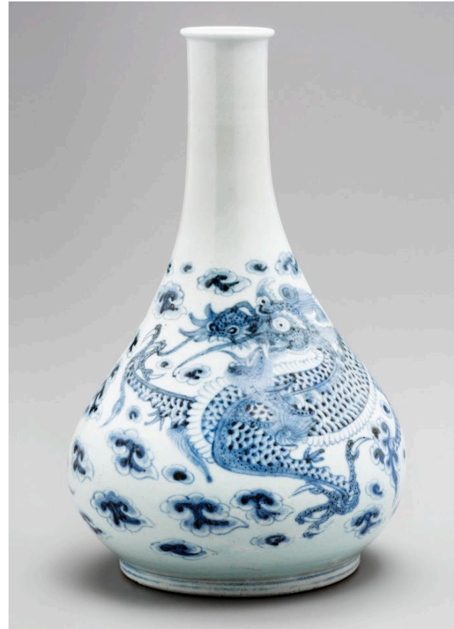
Korean. Bottle with Dragon , 19th century. Porcelain, underglaze cobalt, 13 1/4 × 8 inches. Detroit Institute of Arts, Museum Purchase, funds from the G. Albert Lyon Foundation Fund. 2016.104