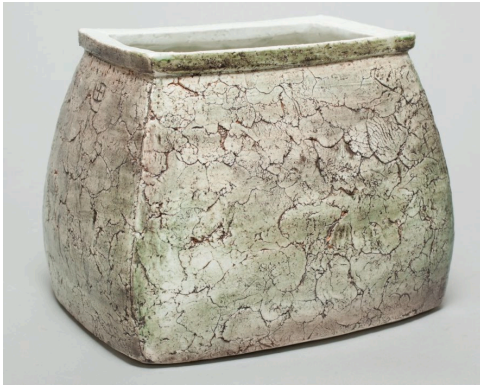
Kim Yikyung (Korean, born 1935). Rectangular Vase , ca. 1997. Porcelain, celadon glaze, 6 3/4 × 8 1/2 × 7 inches. Detroit Institute of Arts, Gift of the Honorable Joseph P. Carroll. 1999.83