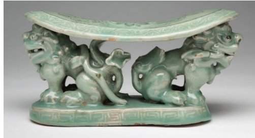
Korean. Pillow , 12th–13th century. Stoneware with slip and celadon glaze, 4 3/4 × 9 1/2 × 3 inches. Detroit Institute of Arts, Founders Society Purchase, New Endowment Fund, and Benson and Edith Ford Fund. 80.39