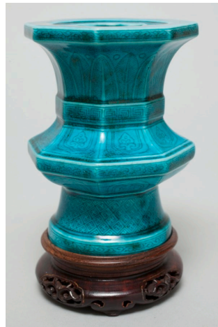
Chinese. Zun Vessel , 18th–19th century. Glazed porcelain, Overall: 4 1/4 × 3 1/4 inches, Including base: 5 1/4 × 3 1/4 inches. Detroit Institute of Arts, Bequest of James Pearson Duffy. 2010.167