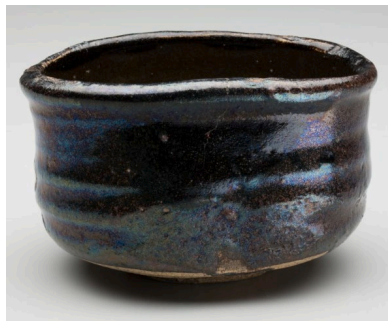
Japanese. Tea Bowl , late 16th–early 17th century. Mino ware, Oribe-guro type stoneware, 3 3/8 x 5 7/16 in. Detroit Institute of Arts, Museum Purchase, Robert H. Tannahill Foundation Fund. 2013.42