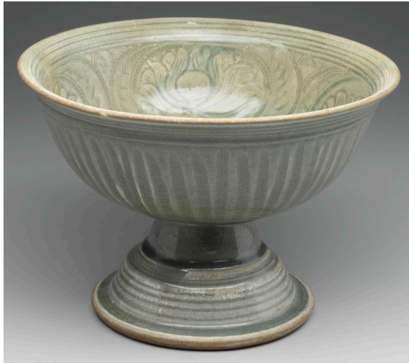
Thai. Stem Bowl with Incised Lotus and Concentric Bands , 14th century. Stoneware, celadon glaze, 6 1/2 × 9 1/8 inches. Detroit Institute of Arts, Gift of the Honorable and Mrs. G. Mennen Williams. 73.308