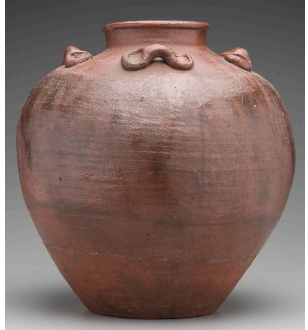
Japanese. Tea Storage Jar , late 16th–early 17th century. Stoneware with ash glaze, 16 7/8 x 17 inches. Detroit Institute of Arts, Founders Society Purchase, New Endowment Fund and Henry Ford II Fund. 1989.73