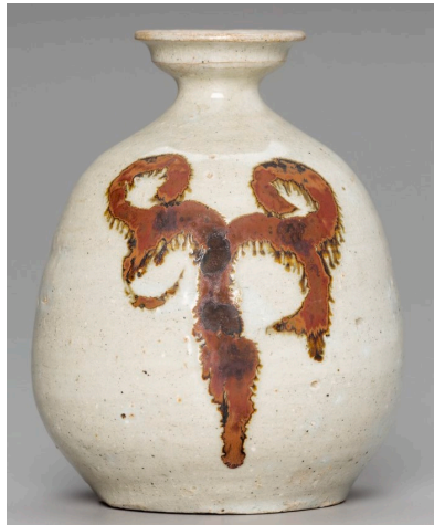
Korean. Porcelain Bottle with Underglaze Plant Design , 17th century. Porcelain, underglaze iron pigment, 6 5/8 × 4 3/4 inches. Detroit Institute of Arts, Gift of Philip Kang. 2016.105