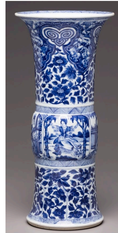
Chinese (for export to the European Market). Beaker Vase (Gu) , ca. 1700. Porcelain, underglaze blue, 20 1/8 × 9 1/2 inches. Detroit Institute of Arts, Museum Purchase, Robert H. Tannahill Foundation Fund. 2018.23.1