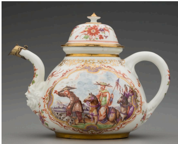
Meissen Porcelain Manufactory, German, founded 1710, Manufacturer. Johann Gregor Höroldt, German, 1696–1775, Decorator. Teapot , 1723 or 1724. Hard-paste porcelain, vitreous enamel, gold; silver-gilt mounts, 5 × 4 1/4 × 6 1/2 inches. Detroit Institute of Arts, Founders Society Purchase, gift of Ruth Nugent Head and City of Detroit by exchange. 1992.43