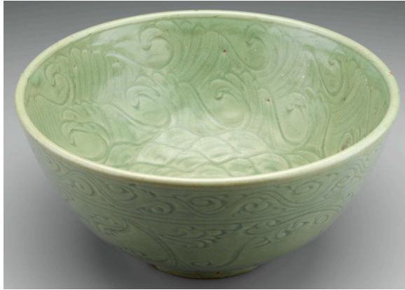
Chinese. Large Bowl with Incised Floral and Wave Designs , late 14th century. Clay, glaze, 5 1/8 × 12 1/4 inches. Detroit Institute of Arts, Gift of the Honorable and Mrs. G. Mennen Williams. 73.338