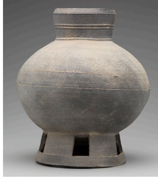
Korean. Jar with Pedestal Base , mid 1st–mid 6th century. Stoneware, 14 × 9 3/4 × 39 1/2 inches. Detroit Institute of Arts, Museum Purchase, Robert H. Tannahill Foundation Fund. 2015.10