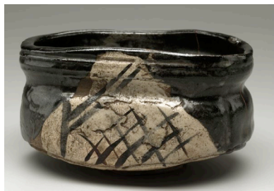
Japanese. Tea Bowl , 17th–18th century. Stoneware with black and translucent glazes, 2 7/8 x 4 7/8 x 5 1/4 inches. Detroit Institute of Arts, Gift of Frederick Stearns. 73.182