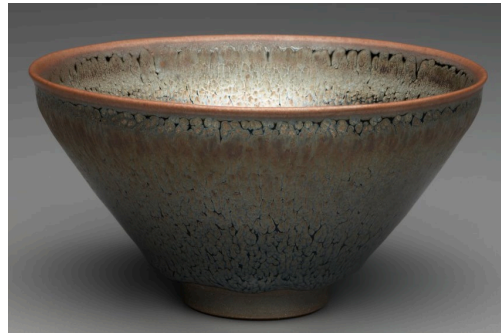
Kamada Koji (Japanese, born 1948). Tenmoku Tea Bowl , 2014. Stoneware with Tenmoku glaze, 2 3/4 x 5 1/8 inches. Detroit Institute of Arts, Museum Purchase, Friends of Asian Arts and Cultures Acquisition Fund in honor of Graham W. J. Beal. 2015.70