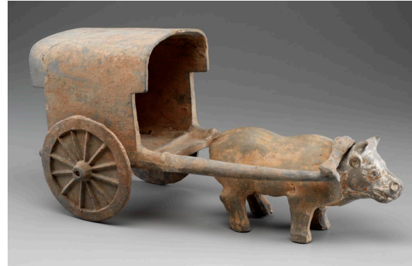
Chinese. Ox and Cart , 220–589 CE. Grey pottery, 8 1/2 × 7 3/4 × 16 5/8 inches. Detroit Institute of Arts, Gift of Mrs. Robert T. Keller. 1994.144