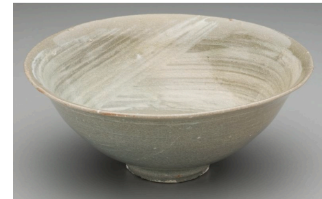
Korean. Buncheong Bowl , 15th century. Stoneware, slip, glaze, 3 1/4 × 7 3/4 inches. Detroit Institute of Arts, Museum Purchase, Robert H. Tannahill Foundation Fund. 2015.12