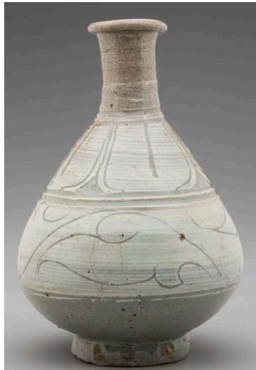
Korean. Buncheong Bottle , 15th century. Stoneware, slip, glaze, 9 1/4 × 5 5/8 × 21 inches. Detroit Institute of Arts, Museum Purchase, Robert H. Tannahill Foundation Fund. 2015.9