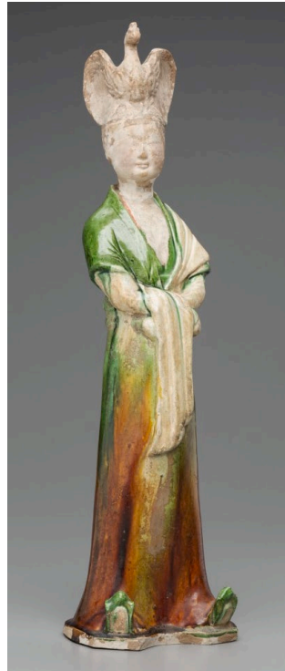
Chinese. Lady with Phoenix Headdress , 618–906. Earthenware with three-color glaze, 17 1/2 × 4 × 3 5/8 inches. Detroit Institute of Arts, City of Detroit Purchase. 29.342