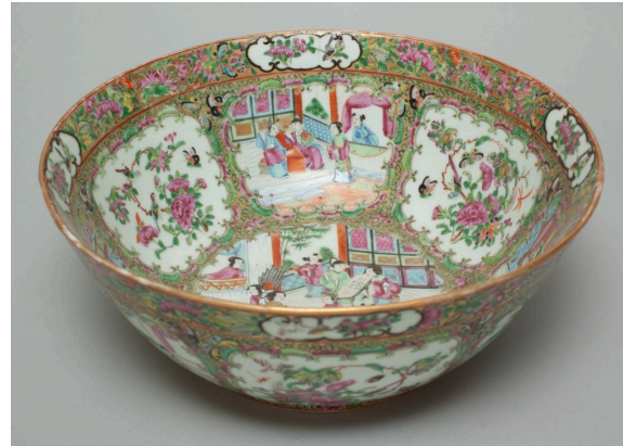
Chinese (for export to the European or American Market). Bowl , ca. 1850. Glazed hard paste porcelain with polychrome enamel, 5 3/8 × 12 3/4 inches. Detroit Institute of Arts, Gift of an anonymous donor. F1985.48