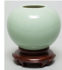
Chinese. Jarlet , 18th–19th century. Celadon glazed porcelain, Overall: 2 1/2 × 3 inches, Including base: 3 1/2 × 3 inches. Detroit Institute of Arts, Bequest of James Pearson Duffy. 2010.168